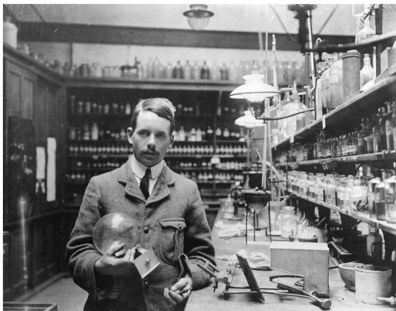
Figure B.4 Henry Moseley (1887–1915) was born in Weymouth on the southwest coast of England. After receiving his Ph.D. in physics from Oxford University, he initiated a research program on the X-ray spectra of the elements at Manchester University. This research led to the concept of atomic number and to the elucidation of the position of the elements in the periodic table. In 1914, he returned to Oxford to continue his research, but as soon as World War I started, he enlisted as an artillery officer in the British army. Tragically, he was killed in the Battle of Gallipoli in August of 1915 at the age of 27. Moseley was on track to a brilliant scientific career, and many of his colleagues were convinced that he would have received the Nobel Prize had he lived. (Nobel Prizes are not awarded posthumously.) Because of Moseley's untimely death, the British government, as well as many others, instituted a policy that scientists not be allowed to enlist for combat duties.