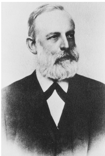
Figure B.3 Julius Lothar Meyer (1830–1895) was born in Varel, Germany. Meyer studied medicine in Zürich, earning a degree as a physician in 1854 and a Ph.D. at the University of Breslau in 1858. In 1876 Meyer became the first professor of chemistry at the University of Tübingen, a post he held until his death.

and also made allowances for a few discrepancies in atomic masses. Nevertheless, their tables were very similar and it is likely that both benefited from each other's work. Although both men are entitled to the honor of the discovery of the periodic table and each acknowledged this, Mendeleev has emerged as the primary author. It is interesting that Mendeleev lived until 1907, and so was eligible for a Nobel Prize, which was instituted in 1901, but never received one in spite of creating what is perhaps the best-known icon in all of science. Finally, in 1997 Mendeleev was awarded an even rarer distinction. Element 101, mendelevium (Md), was named in his honor.